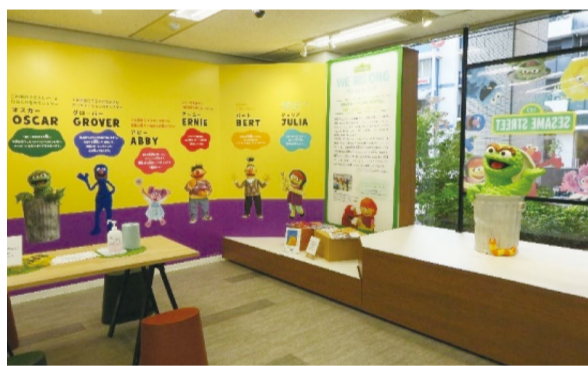
TM and © 2026 Sesame Workshop