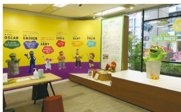
TM and © 2024 Sesame Workshop